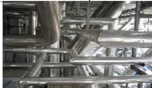
PROJECT PD2 REHABILITATION - Installation of Calcium Silicate for Injet GE Plenum at Tungku Jaafar Power Station, Port Dickson Negeri Sembilan