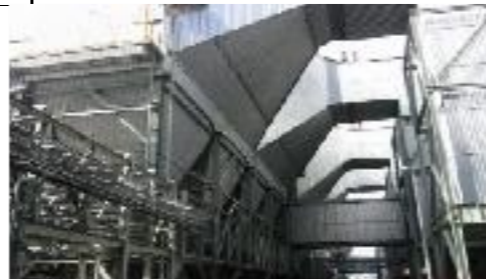
HOT INSULATION WORK - Removal and Review of Cladding and Insulation for Oil & Gas Plant