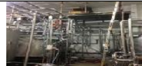
SCAFFOLDINGWORK- Shut Down works at Kerry Plentong