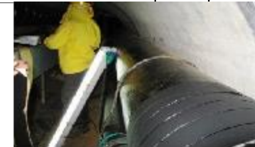
TITAN - Tunnel Pipe Wrapping For KSL Project Work (2009)