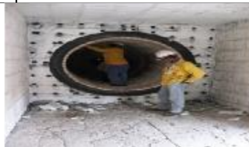
SNC - Oto repair Insulation work (2011)