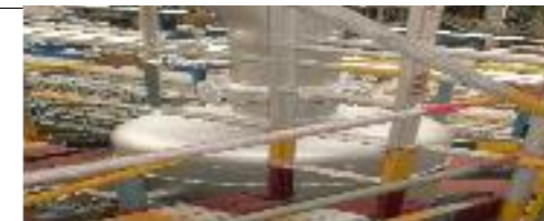
PROJECT CUI - Removal, replace of insulation and cladding and finished with industrial painting for the corroded