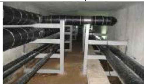
WRAPPING WORK - Removal and Review of INSURAP