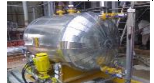
PROJECT PD2 REHABILITATION - Installation of Calcium Silicate for Vessel Drum at Tungku Jaafar Power Plant Port Dickson, Negeri Sembilan