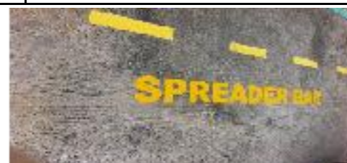
PAINTING LABELLING WORK - Labelling work with Termoplastics for ASIAFLEX Plant at Tg Langsat