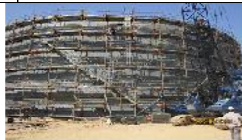
SCAFFOLDING WORK - Scaffolding for Sphere Tank for KNM Process Group