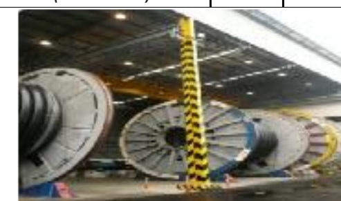
PROJECT -Painting for facility door and Beam structure at Asiaflex (Technip) Pasir Gudang