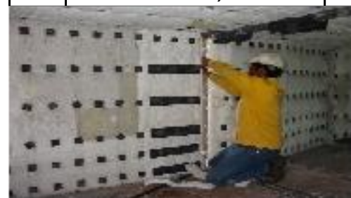
SNC Pasir Gudang Duct Flanges Ceramic Insulation Repair