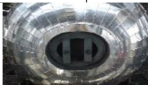
PROJECT PD2 REHABILITATION - Installation of Calcium Silicate for HP 2B Drum at Tungku Jaafar Power Station Port Dickson, Negeri Sembilan