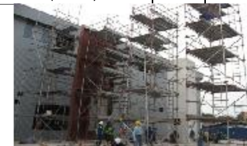
SCAFFOLDING WORK - Erection scaffolding