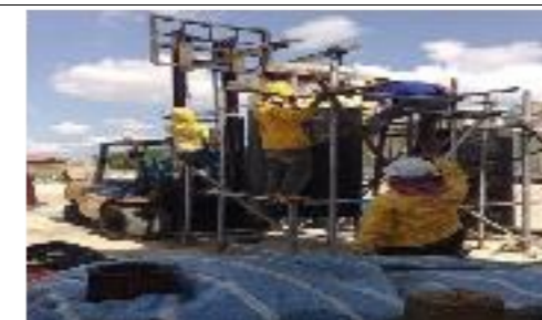
COLD INSULATION WORK - Removal & Renew of Cladding and Insulation at IDEMITSU SM tower, Pasir Gudang