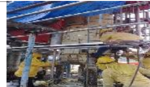
COLD INSULATION WORK - Removal & Renew of Cladding and Insulation at IDEMITSU SM tower, Pasir Gudang