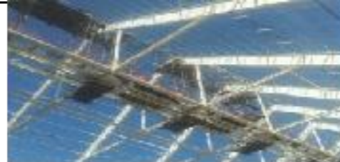
SCAFFOLDINGWORK- Samur Projek at Sipitang Sabah