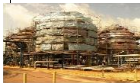
TITAN - TK5110A,B,C,D&E Cold Insulation Cladding Replace Work (2012)