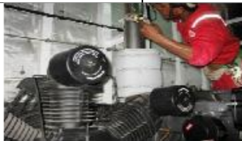
MMHE - Piping Insulation Work for Project FSRU (LNG LIBRA) (2009)