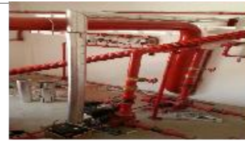
INSULATION WORK- Insulation and Cladding installation for 14 pump room