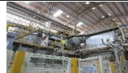
DUCTING INSULATION WORK- Hot Insulation Work for ShutDown Maintenance at KIMBERLY CLARK