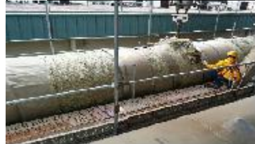
HOT INSULATION WORK - Removal and Review of Cladding and Insulation at Malakoff U-10 Boiler Outage, Johor