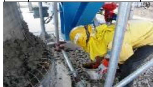
IDEMITSU - TA2009 Fireproofing Work (2009)