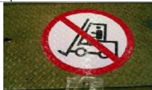
PAINTING WORK - Painting on chequered plate at Asiaflex (Technip) Pasir Gudang