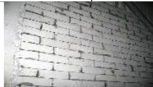
TITAN - TA11 Furnace work (Refractory,SLE,Radiant Box , Shadow box & ect ) (2011)