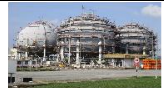
PROJECT BHP 2015 - Erection and Dismantle of scaffolding work for 14 nos tanks and complete with industrial tanks at BHP Johor Port