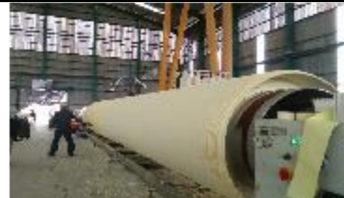
COLD INSULATION WORK- PIR Installation Insulation for LNG Piping at Pengerang Dialog Warehouse, Johor