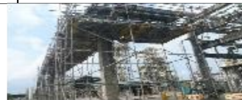
PROJECT SCAFFOLDING - Erection and Dismatle of Scaffolding Hangging and Suspension Type for TPC 1 Lotte Chemical (M)