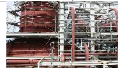
SCAFFOLDING WORK - Erection scaffolding