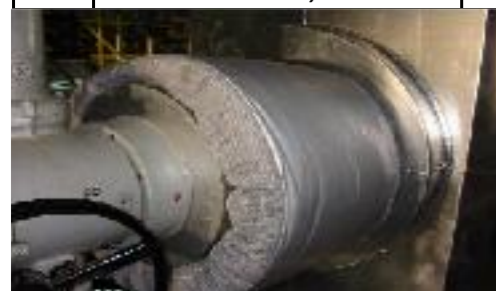
MATTRESS INSULATION - Mattress fabrication and installation for Turbine at ALSTOM POWER PLANT