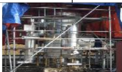
SCAFFOLDING WORK - Erection scaffolding shelter with Canvas