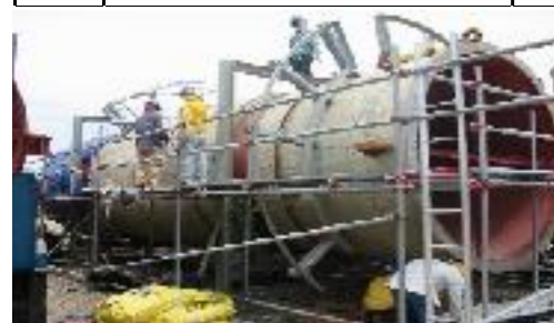
INSULATION WORK - Installation of Rockwool to the tower at Teluk Jawa Project