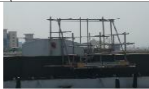
SCAFFOLDING WORK - Heavy Duty Scaffolding Erection and Dismantle at Lotte Chemicals Titan