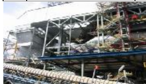
HOT INSULATION WORK - Removal and Review of Cladding and Insulation for Oil & Gas Plant