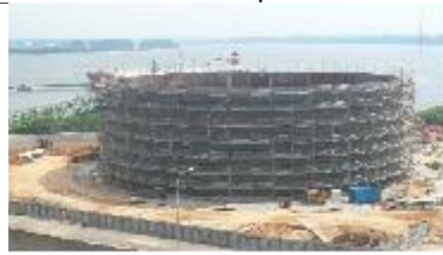
Scaffolding Work- Erection and Dismantle of Scaffolding Work for Benzene and Naptha Tank for KNM Group at Lotte Terminal 3