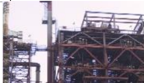
INSULATION WORK- Insulation Work for Malacca Refinery