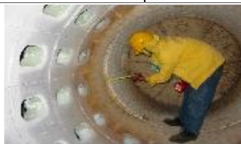
SNC - OTO Overhead repair Insulation work (2011)