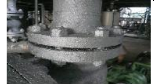
PROJECT CUI - Removal, replace of insulation and cladding and finished with industrial painting for the corroded equipment at Titan Group