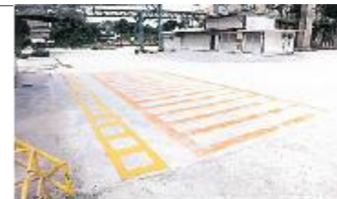
PAINTING WORK - Palletize Loading Bay at Holcim Warehouse Plant at Pasir Gudang