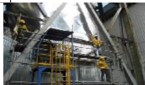
SCAFFOLDING & INSULATION WORK - Removal and Renew of Cladding and Insulation at TNB Generation