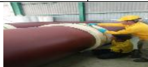
COLD INSULATION WORK- PIR Installation Insulation for LNG Piping at Pengerang Dialog Warehouse, Johor