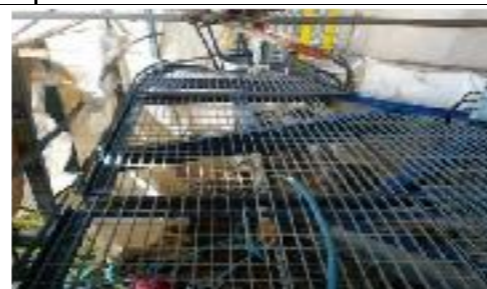
MECHANICALS WORK - Rejuvenation Work T-360LP platform