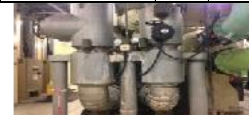
COLD INSULATION WORK- Chiller water pipe insulation renewal at Segate Senai