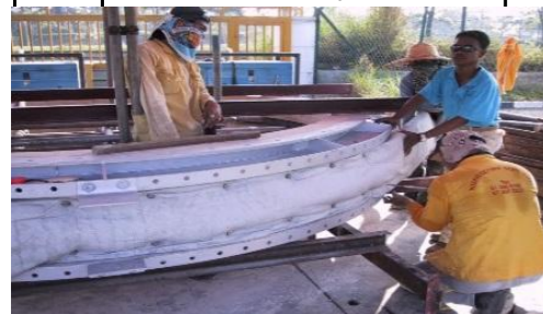
INSULATION WORK- Assembly of Expansion Joint