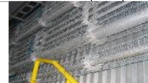
INSULATION WORK- Removal, replace of insulation and cladding and finished with wired mesh for personal protection at YTL