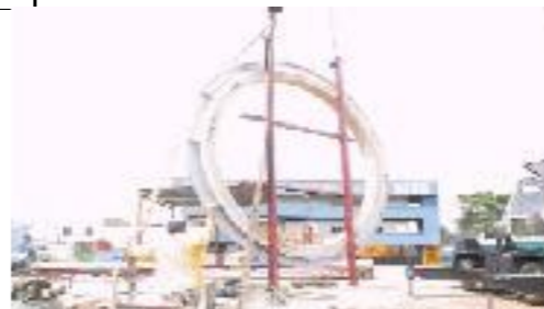
REFRACTORY REPAIR WORK