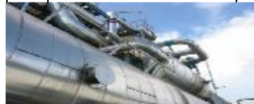
HOT INSULATION WORK - Removal and Review of Cladding and Insulation at Oil & Gas Plant