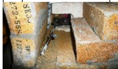
TITAN -Boiler B ( PK-3202 ) Refractory Repair Work (2009)