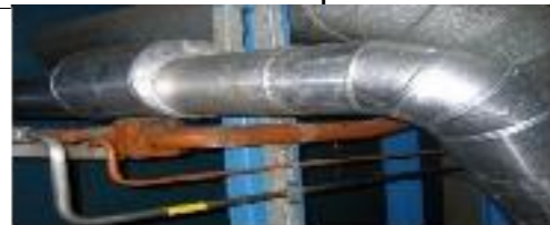
INSULATION WORK - Removal and Renew of Cladding and Insulation for