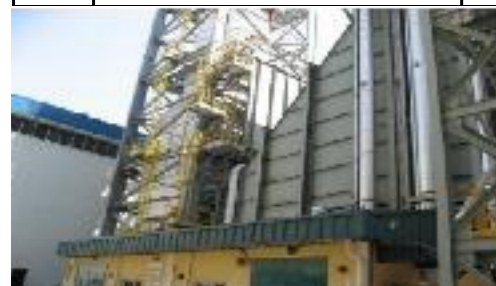
HOT INSULATION WORK - Removal and Review of Cladding and Insulation at Pahlawan Power Station, Malacca