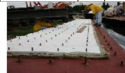
CERAMIC INSULATION - Installation of Kaowool / Ceramic for Furnace at EESB PD Power Station