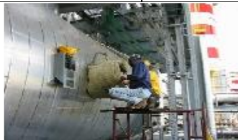
HOT INSULATION WORK - Removal and Review of Cladding and Insulation at ALSTOM POWER PLANT