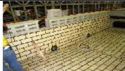
REFRACTORY WORK- Refractory work for Acid Water Tank at Bahru Steel, Johor