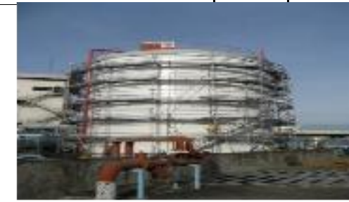
PROJECT - Painting and Scaffolding work for HTM Tank Idemitsu Petrochemicals (M) PG