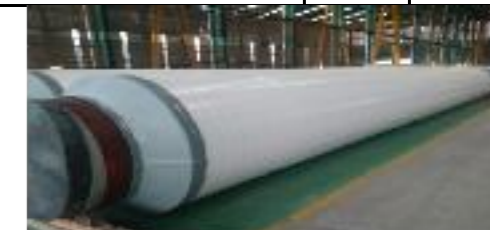
COLD INSULATION WORK- PIR Installation Insulation for LNG Piping at Pengerang Dialog Warehouse, Johor