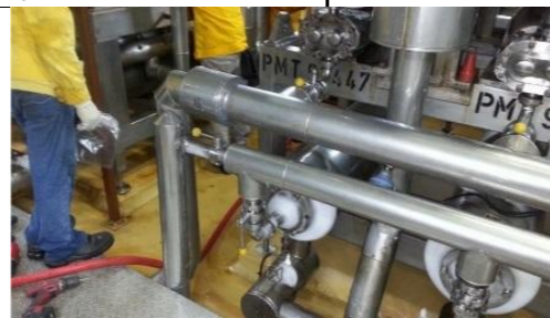
INSULATION WORK- Insulation Freeze Conc Pilot Plant