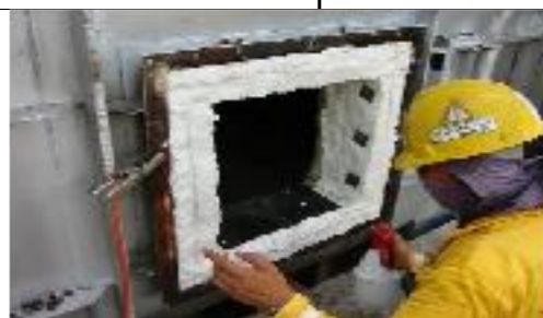
FURNACE MANHOLE INSULATION - Installation of Kaowool / Ceramic for furnace at EESB PD Power Station