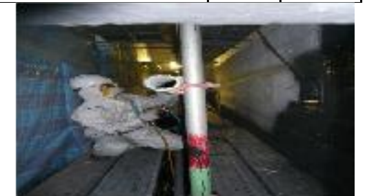
PAINTING WORK - Renewal of fire brick preparation for HRC coating work.