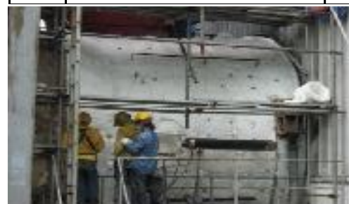
SCAFFOLDING & INSULATION WORK - Removal and Renew of Cladding and Insulation at TNB Generation