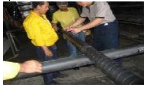
WRAPPING WORK - Removal and Renew of Denso Tape