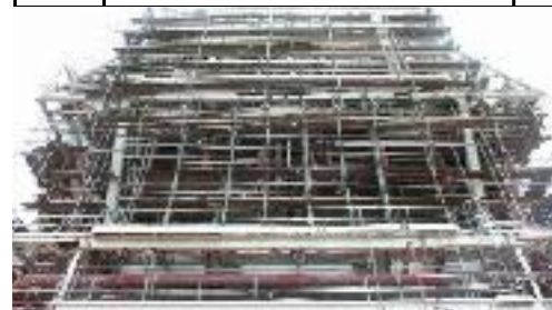
HOT INSULATION WORK - Removal and Review of Cladding and Insulation at HRSG ST 1A EESB