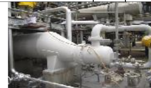
PROJECT CUI - Removal, replace of insulation and cladding and finished with industrial painting for the corroded equipment at Titan Group