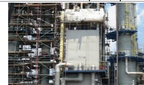
TITAN - TA2006 Insulation, Painting & Scaffolding Work (2006)