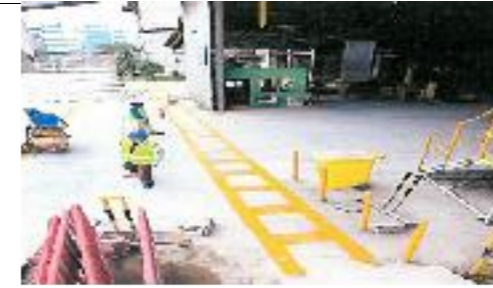
PAINTING WORK - Pedestrian Walk Way at Holcim Warehouse Plant at Pasir Gudang