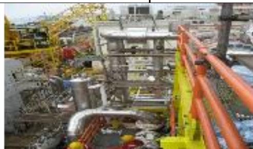
SCAFFOLDING WORK - Renew of Cladding and Insulation at MMHE T-12