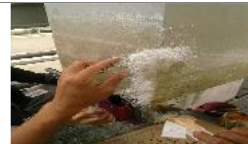
FIBERGLASS WORK - Applying of Fiberglass onto the severe damaged cable duck at PPE Titan Group