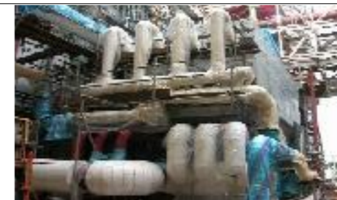
PROJECT INSULATION - Installation of Calcium Silicate for fuel gas line at EESB PD Power Station