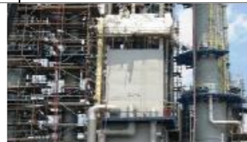
TITAN - TA2006 Insulation,Painting & Scaffolding Work (2006)