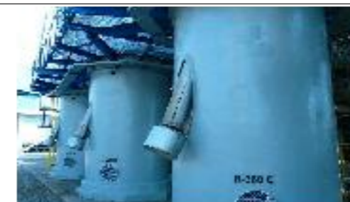
PAINTING WORK - Apply under coat of paint