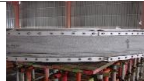
INSULATION WORK- Repair of Expansion Joint