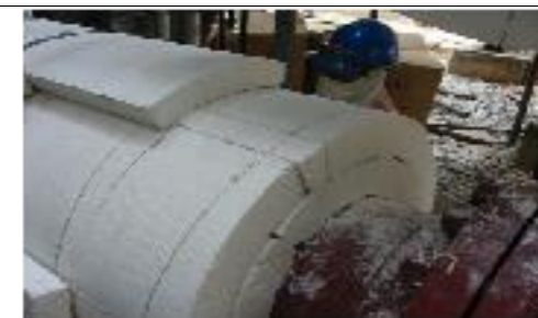
HOT INSULATION - Installation of Calcium Silicate at EESB PD Power Station GT-1