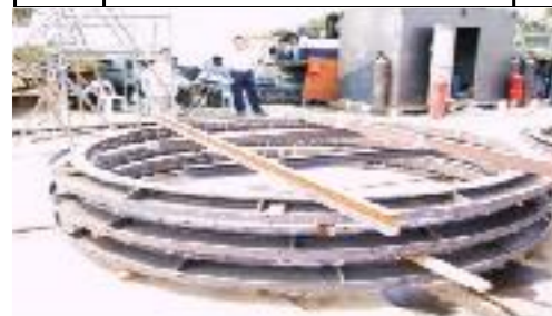
TNB-AAM Expansion Joint (2001)