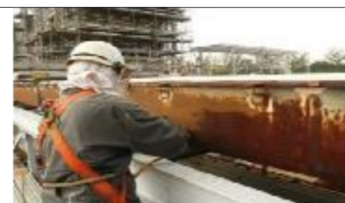
PROJECT -Corrosion Under Insulation Inspection (PIPING & VESSEL) at IDEMITSU SM(M) Pasir Gudang,JB