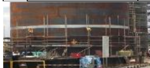
SCAFFOLDING WORK- NPBT Tank at Johor Port