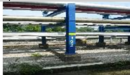
PAINTING WORK - Painting and Labelling for BTX Plant of Titan Group at Pasir Gudang