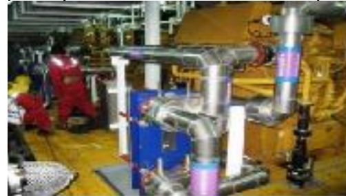
MMHE - Piping Insulation Work for Project FSRU (LNG LIBRA) (2009)