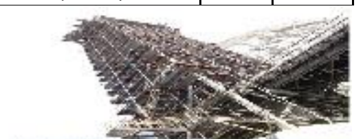
PROJECT SCAFFOLDING- Erection and Dismantle of Scaffolding at Height 84M at LafArge Cement at Pasir Gudang