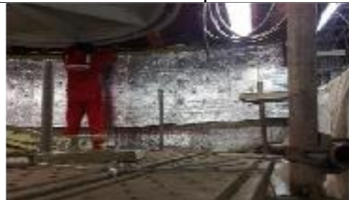
SUNBORN -Installation Insulation Of R/w & Armaflex On Decks , Stiffeners and Piping (2011)