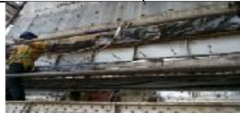
HOT INSULATION WORK- ID Fan insulation work at Tg Bin Power Plant