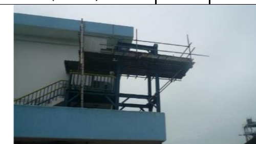
SCAFFOLDING WORK - Scaffolding Hanging Suspension Type at Lotte Chemicals Titan (M) Sdn Bhd