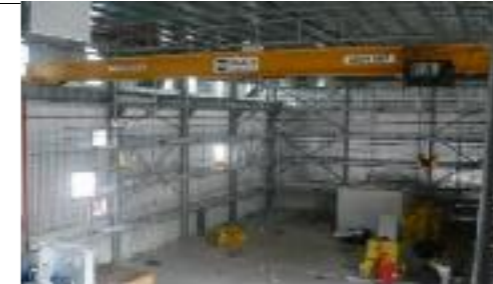
PROJECT -New Machine House Acoustic Insulation Work at MOX LINDE(M) Pasir Gudang, Johor Bahru