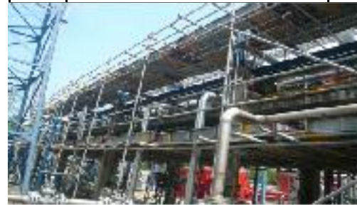
SCAFFOLDING WORK - TPC 1 Utility Main Piperack Rejuvenation at Lotte Chemicals Titan (M) Sdn Bhd