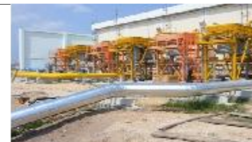
PROJECT INSULATION - Installation of Calcium Silicate for fuel gas line at EESB PD Power Station