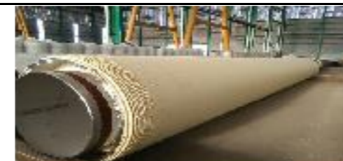
FIBERGLASS WORK - Applying of Fiberglass onto the severe damaged cable duck at PPE Titan Group