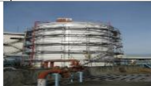
PROJECT-Painting and Scaffolding work for HTM tank IDEMITSU PETROCHEMICALS (M) Pasir Gudang, Johor Bahru