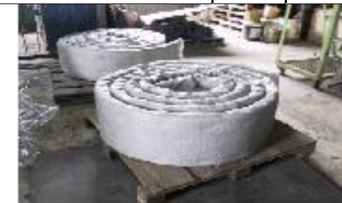
INSULATION WORK - Mattress Fabrication