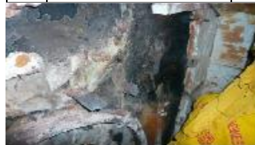
REFRACTORY WORK - In the removing process of damaged Fire brick at Boiler