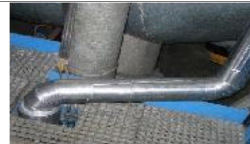
INSULATION WORK - Removal and Renew of Cladding and Insulation for YTL Cable Duct